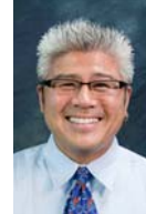
Lamb Caro Ponderosa